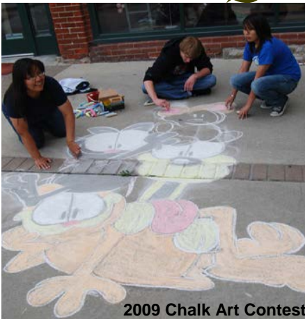
2009 Chalk Art Contest